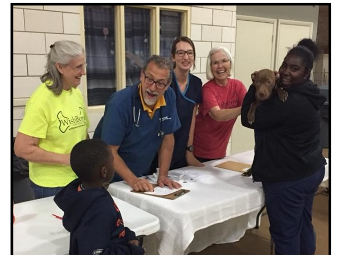
Wishbone Canine Rescue Vaccination Clinic @ WACC served 30 family pets.