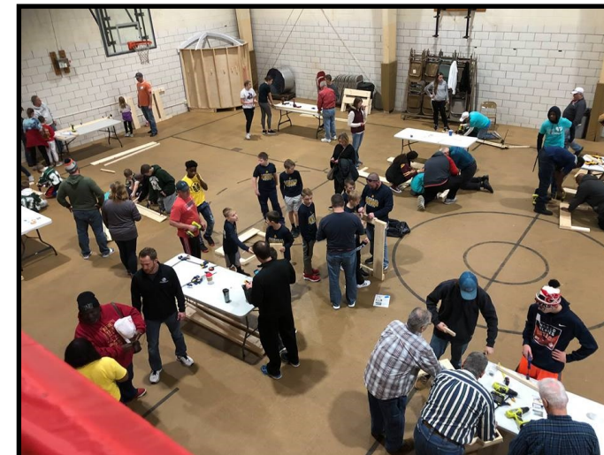
Partnering with WBRP to host a Bed Blitz. Beds built for 15 local youth!