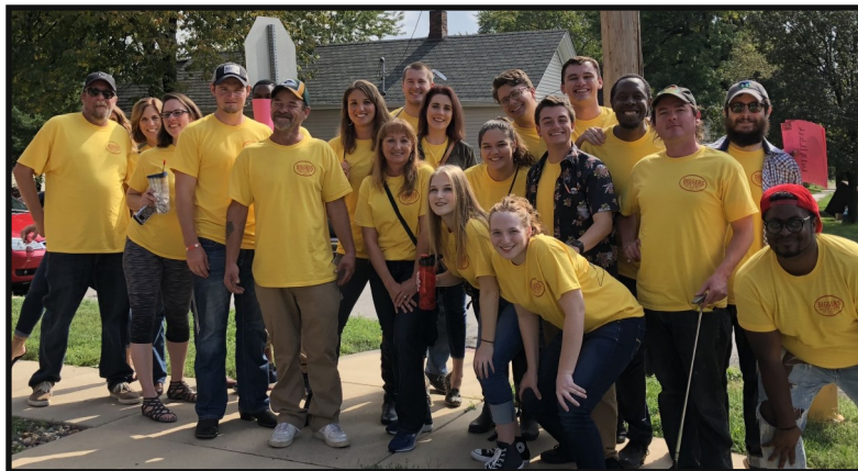
One of several Putt Putt for Charity teams